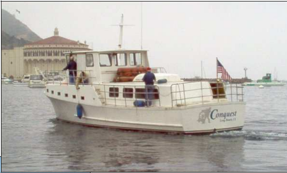
Conquest in Avalon ▼