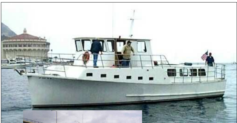
◀ The Conquest, our custom long range cruising trawler. Built by Sea Scouts!

If you prefer, you can call us at: (562) 425-9523 . We'll invite you down to meet us in person. Look us over! We think you'll like what you see!