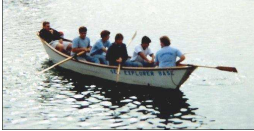
▲ Team rowing competition