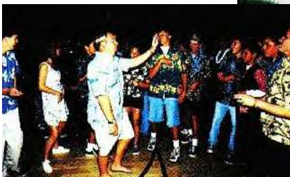
◀ Fun Stuff -Luau's, Dances, Competitions and other opportunities to let you socialize with other Sea Scouts.

Welcome to the fun and adventure of Sea Scouting. Whether you look to the sea for a career or lifelong hobby, Sea Scouting is for you!