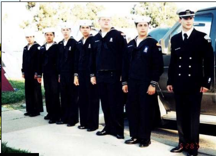
▲ Pride in Yourself & Your Shipmates.